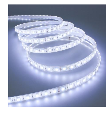
POWER OF THE LED LIGHT SOURCE