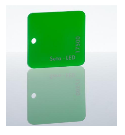
<u>DIFFUSION</u> capacity of the acrylic sheet